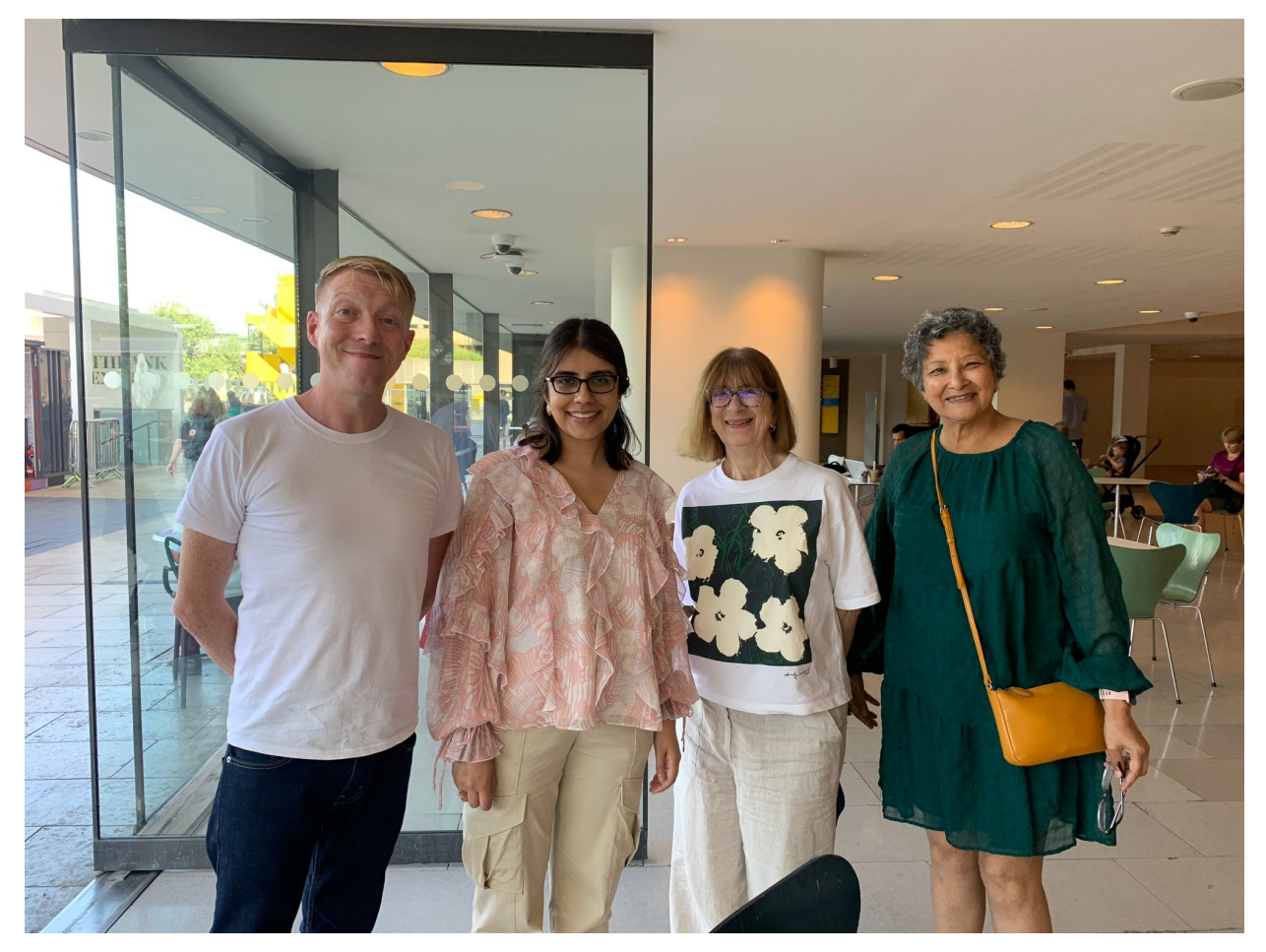
Image: 4 - Some of the London regulars arriving for the support group

Attendance varies from about 20 for the London group to 7-8 for the other groups.