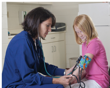
Monitoring your child's blood pressure.

Unfortunately, there are no proven treatments that can slow the progression of ARPKD. It's possible that controlling blood pressure carefully might help to delay damage to the kidneys, but experts are not yet sure. This has been shown for patients with chronic kidney disease in general, but not for children with ARPKD in particular.